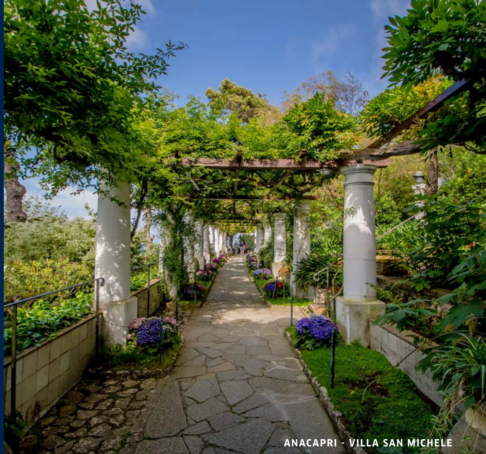
ANACAPRI - VILLA SAN MICHELE

embark at 10 am - disembarkation by 6 pm on the following day